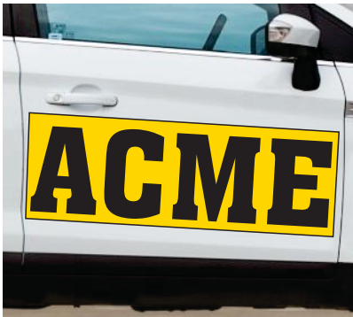
Very big, crowded