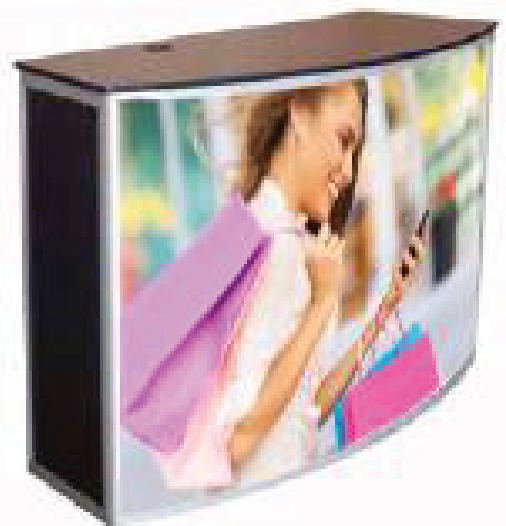
Image must be exact size and fixed with magnetic tape only